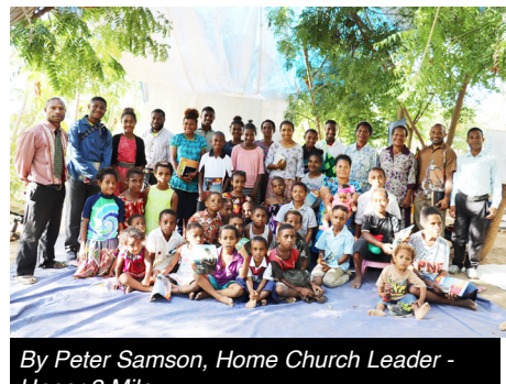
Upper 2 Mile

Covid-19 lockdown period opened many doors for church members to worship in many big churches in Port Moresby, National Capital District. Upper 2mile is a small home church under 2 Mile church recently formed during the Covid-19 lock-down period with many new interested members and backsliders faithfully attending church. Though it was a lock-down period, church members faithfully returned their tithes and offerings with whatever little they hard. Upper 2 Mile church members are looking forward to build a better shelter for worship with the help of church leaders.