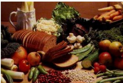
Fruits, vegetables, grains and nuts form the basis of the best diet.

1 Timothy 5:23 No longer drink only water, but USE A LITTLE WINE for your stomach's sake and your frequent infirmities.