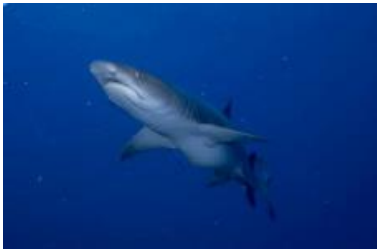
Sharks are unclean because they have no scales.