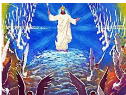
At the Second Coming of Jesus – Death will be conquered.

Some are concerned for those who have died in some terrible way, and the body has been mangled or eaten by wild animals, or some other tragic thing has happened. There is no need to be concerned. God promises in 1 Corinthians 15 to give us a new incorruptible body. We will not possess the same atoms of flesh we now have. In the meantime, God preserves our individual personality and character, then just as He created Adam, so He will re-create us – perfect – to live forever.