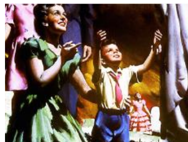
The resurrection of the righteous.

1 Corinthians 15:19,20 If in this life only we have hope in Christ, we are of all men the most pitiable. But now CHRIST IS RISEN FROM THE DEAD, and has BECOME THE FIRSTFRUITS OF THOSE WHO HAVE FALLEN ASLEEP.