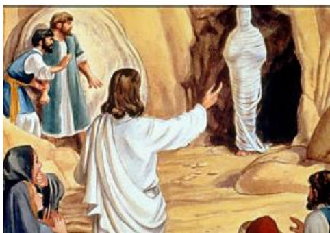
Jesus raises Lazarus from the sleep of death.

John 11:11-14 These things He said, and after that He said to them, “OUR FRIEND LAZARUS SLEEPS, but I go that I may wake him up.” Then His disciples said, “Lord, if he sleeps he will get well.” However, Jesus spoke of his death, but they thought that He was speaking about taking rest in sleep. THEN JESUS SAID TO THEM PLAINLY, “LAZARUS IS DEAD”.