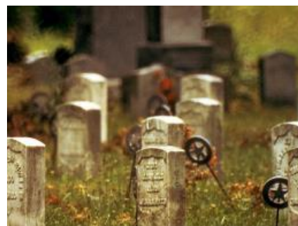
The dead know not anything.

Ecclesiastes 9:5,6 For the living know that they will die; But the DEAD KNOW NOTHING, and they have no more reward, for the memory of them is forgotten. Also THEIR LOVE, THEIR HATRED, AND THEIR ENVY HAVE NOW PERISHED; nevermore will they have a share in anything done under the sun.