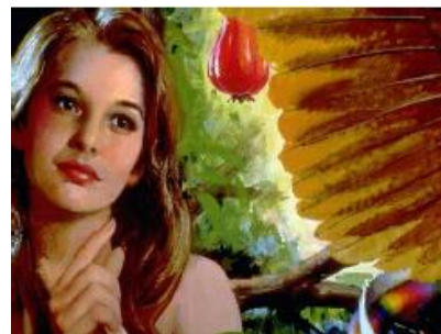
Adam & Eve were tempted to believe that they were immortal.

The devil would have Adam and Eve believe they were immortal (not subject to death) but here it is clearly taught that our bodies are mortal (subject to death). Many today believe man is naturally immortal, even if he has been the worst of sinners, and that some part of him will never die. Millions have been deceived by the devil's assurance: "You will not surely die".