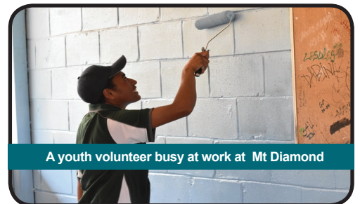
A youth volunteer busy at work at Mt Diamond