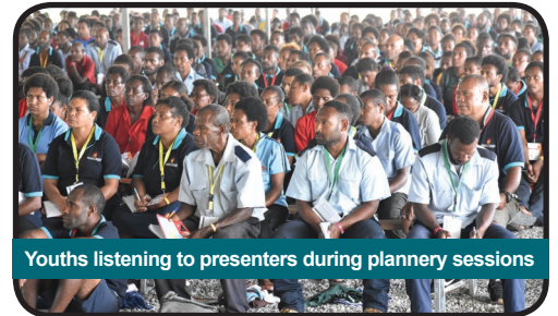
Youths listening to presenters during plenary sessions