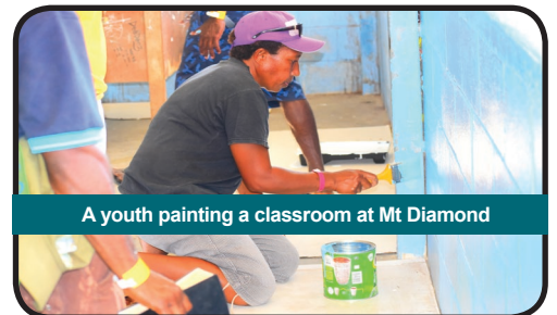
A youth painting a classroom at Mt Diamond