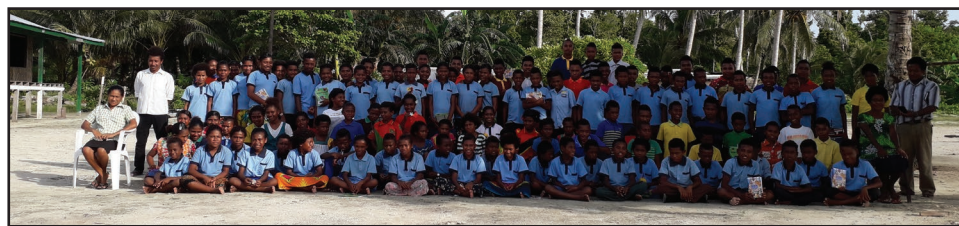
Kaisiga Adventist Primary School students with staff.

More Bibles are needed to effectively run the Bible Summary project and the Bible study methods, he said.