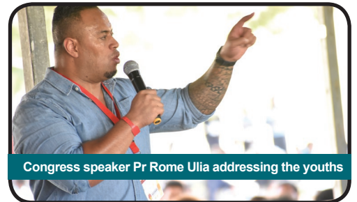
Congress speaker Pr Rome Ulia addressing the youths