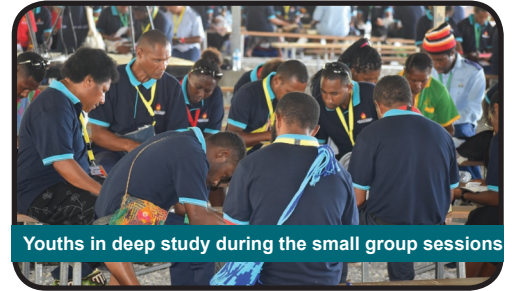
Youths in deep study during the small group sessions