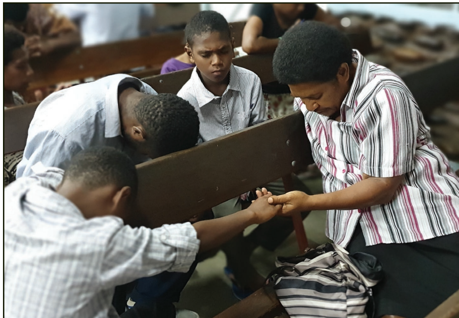
A family praying during prayer and fasting Sabbath in January at the Lae Pidgin Church.

Adventists in the country fasted and prayed for the nation and its leadership on Sabbath, April 4.